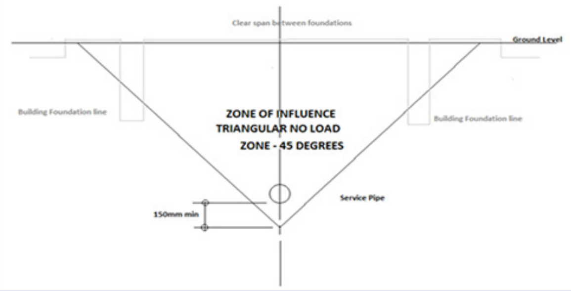
Diagram A - Zone of Influence