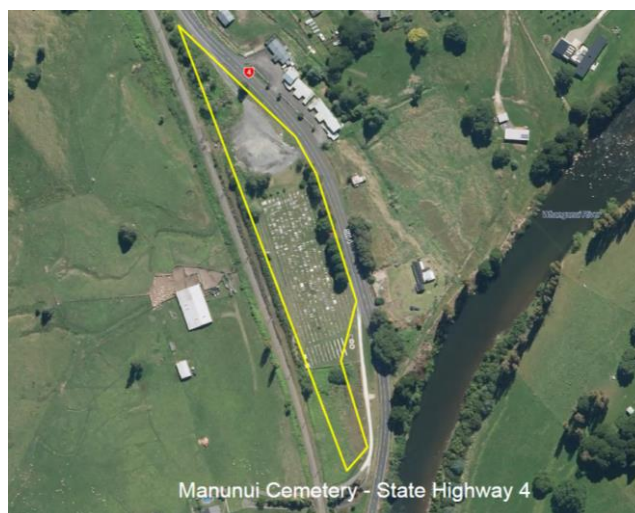
Manunui Cemetery - State Highway 4