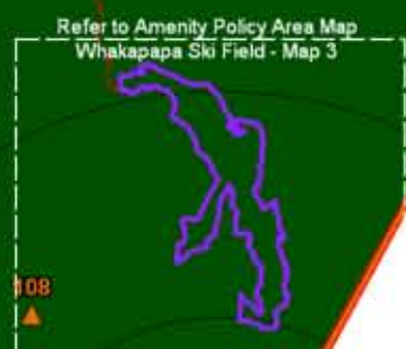
WHAKAPAPA SKI FIELDS