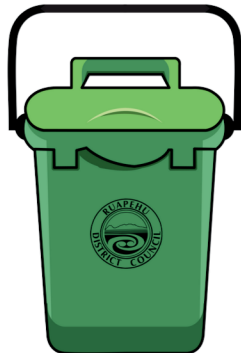
Green food waste bin