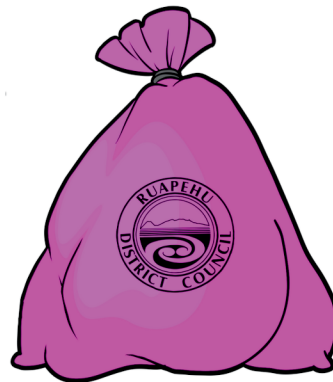
Pink refuse bag

When your green compostable liner is full put it in your green kerbside collection bin. You can also put food scraps directly into your green kerbside bin without it being in a compostable liner bag or use a supermarket brown paper bag. Place your green bin out for collection when it's full.