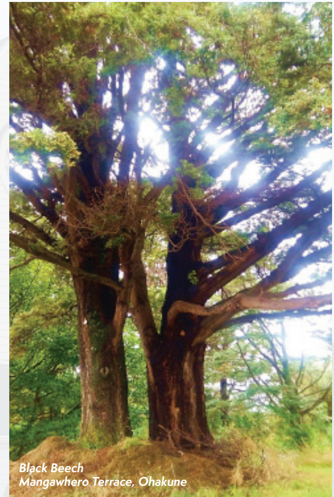
Black Beech Mangawhero Terrace, Ohakune

Any minor trimming, pruning or maintenance that can be undertaken with hand operated clippers in accordance with accepted arboricultural practice or by a qualified arborist does not need consent.