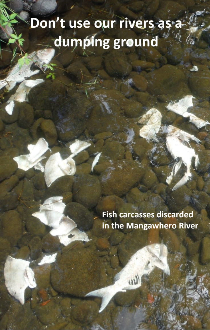
Fish carcasses discarded in the Mangawhero River

Don't use our rivers as a dumping ground